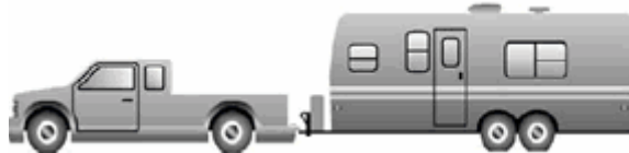
Pickup and House Trailer