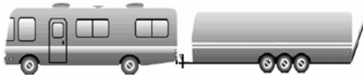
Motorhome and Heavy Trailer